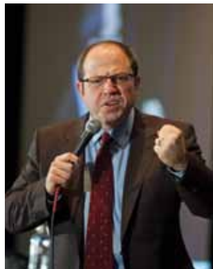
Brent Butt revs up the Monday breakfast crowd.