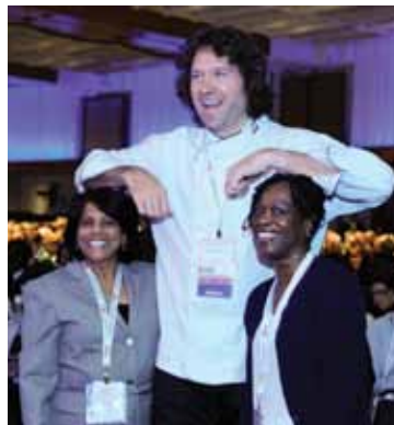
Chef Michael Smith and friends.