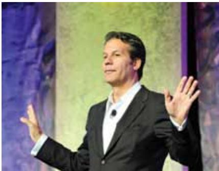
Professor Richard Florida discusses the battle for talent.