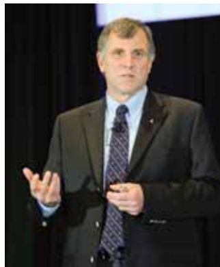
Dr. Dave Williams, astronaut, addresses the Patient Safety session.