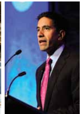
Dr. Sanjay Gupta, CNN's Chief Medical Correspondent.