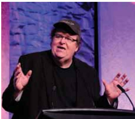
Michael Moore ended his speech by singing "O Canada."