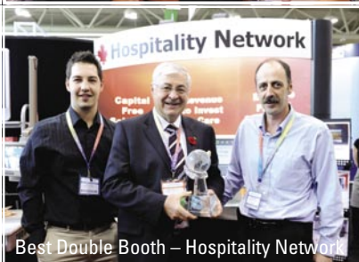
Best Double Booth – Hospitality Network