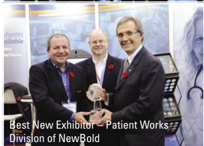
Best New Exhibitor – Patient Works Division of NewBold