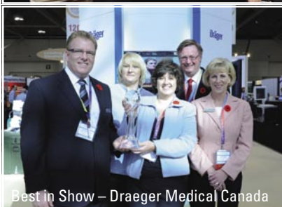
Best in Show – Draeger Medical Canada