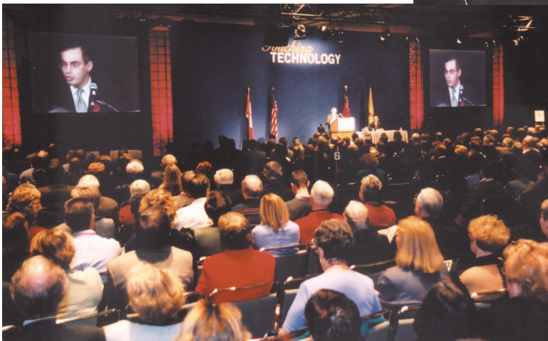
▲ Ontario's Minister of Health and Long-Term Care, Tony Clement, addresses delegates at the Convention's closing session.