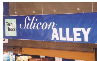
▲ On the exhibit floor, Silicon Alley and the IT education component, Tech Track, showcased leading-edge services and solutions for long-time users and those new to IT.