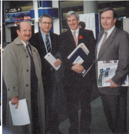
▲ More than 7,000 delegates took the opportunity to preview services and products from more than 270 exhibitors.