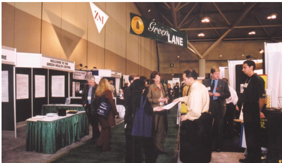
▲ This year, a new addition to the exhibit floor, Green Lane, attracted vendors and delegates with a commitment to environmentally responsible healthcare.