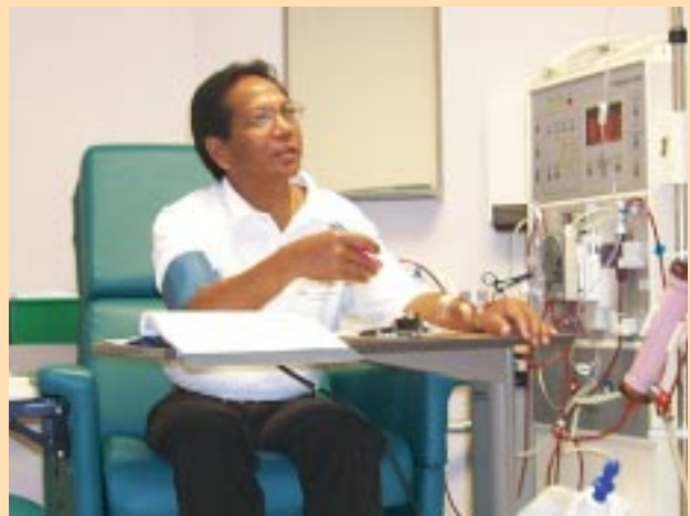
Humber River Regional Hospital patient training to self-administer nocturnal dialysis on equipment from Fresenius Medical Care.

The nocturnal dialysis program at HRRH has served as a global model, and has attracted doctors from the Netherlands, Japan, Sweden, United States, Australia and