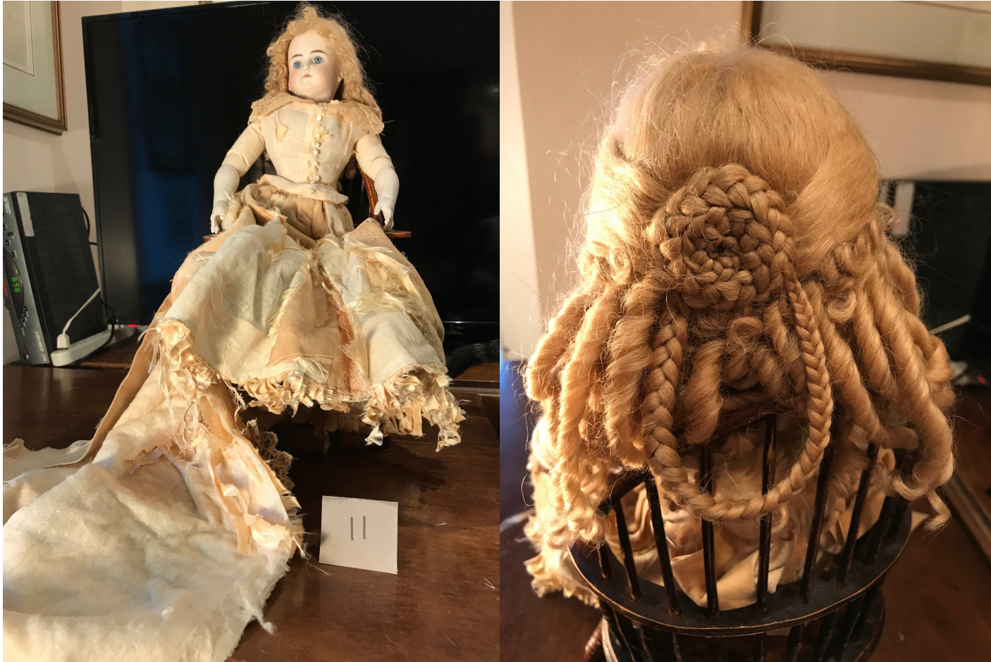
Lovely German Bisque Alt, Beck & Gottschalck Doll - 21" tall. Bald turned early pale bisque shoulder head (extensive repair to front shoulder plate), blue glass eyes, closed mouth with lip shading line, replaced blonde mohair wig, newer cloth body with lovely antique bisque lower arms and legs, original ivory satin and velvet gown with long train (much deterioration to satin on gown).