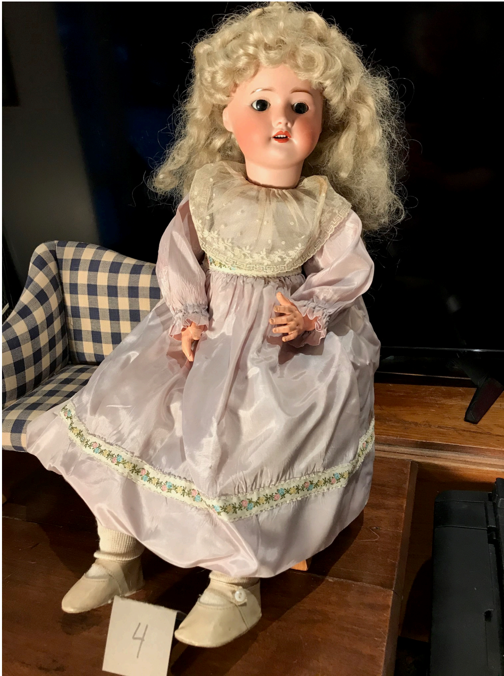
SFBJ French Bisque Child Doll. Mold 60, brown sleeping eyes, painted eyelashes, multi-stroked eyebrows, open mouth with upper teeth, replaced wig, French jointed composition and wood body (repainted lower legs, replaced hands), taffeta dress. 23" Tall. Nice silk dress.