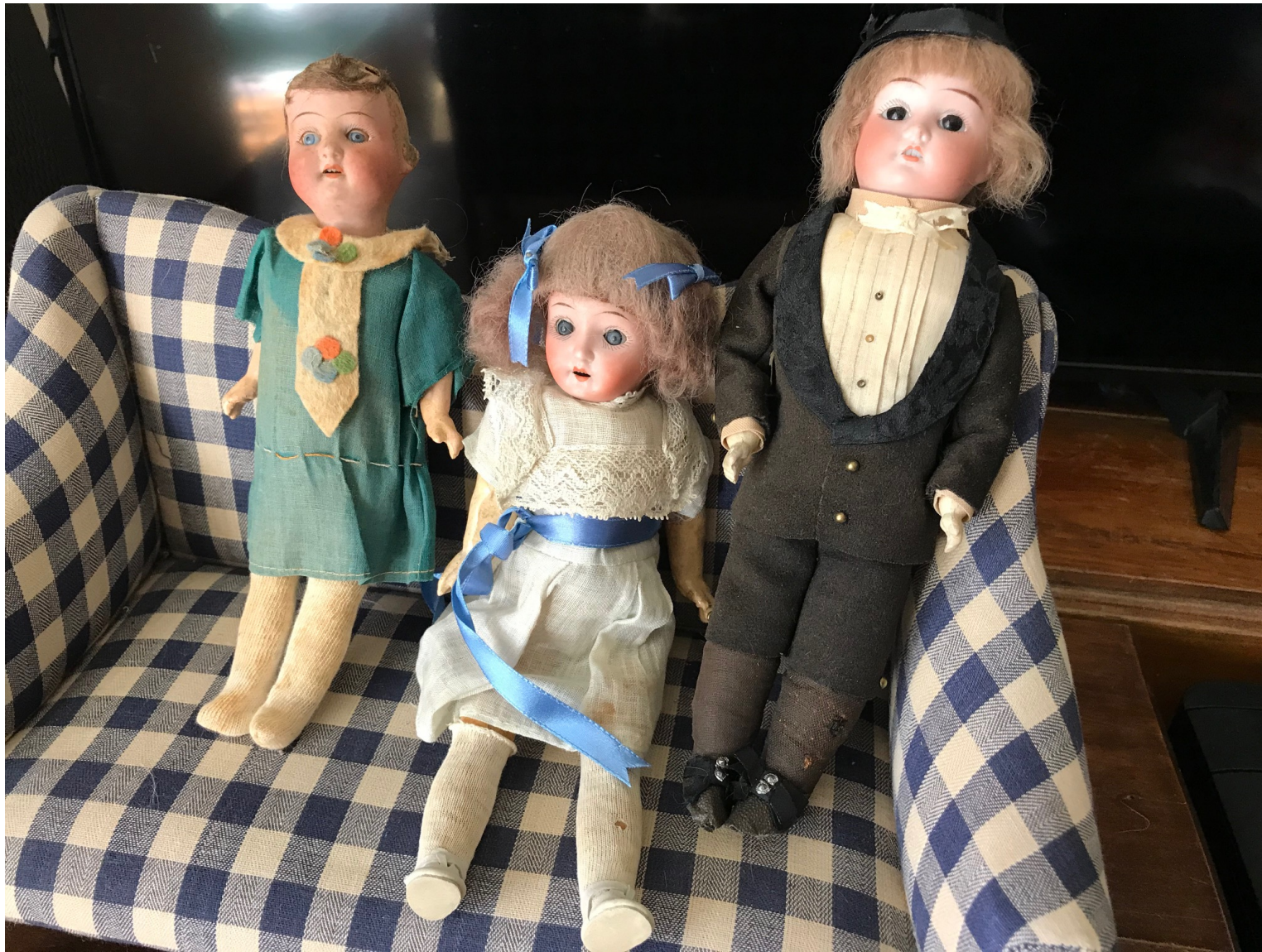
Three small German dolls. The boy is 10" tall and has fixed eyes. The girls have eyes that close and are on very light bodies. The flapper is missing her wig.