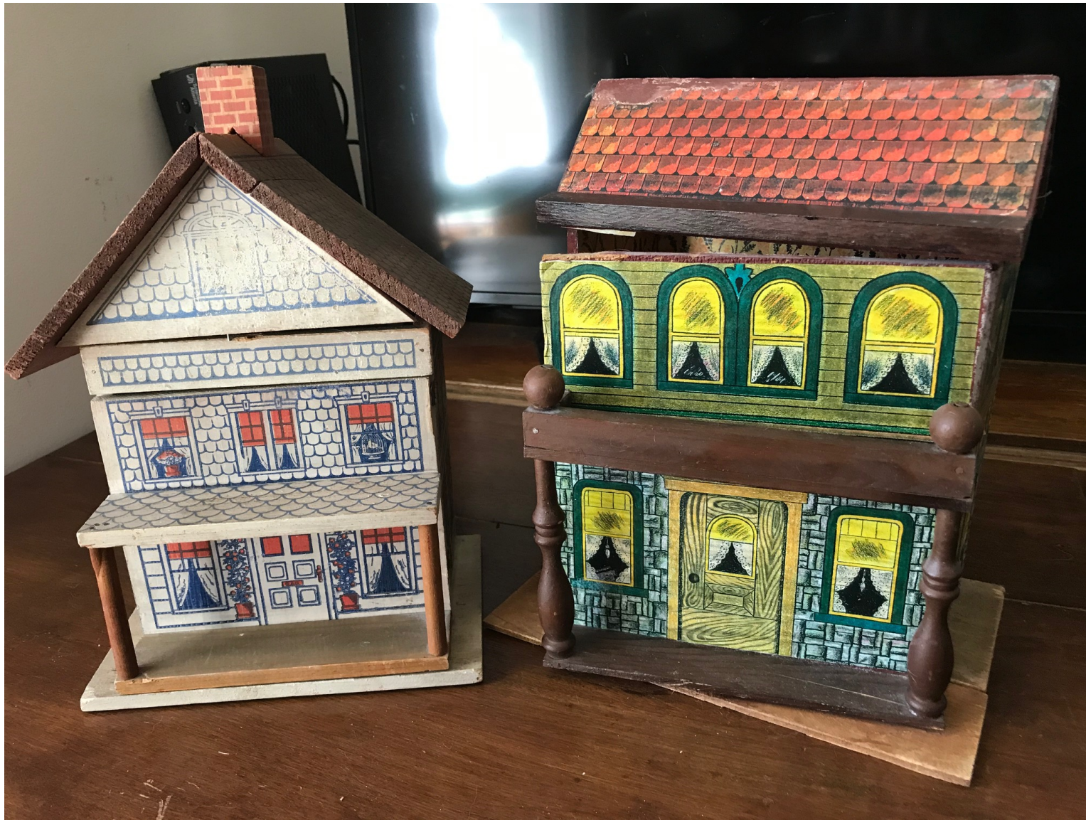
Converse Litho Stamped Wooden Doll House on the left and a Bliss on the right. The Bliss house may not have original paper coverings. Both houses about 12" tall. Both American made circa 1910.