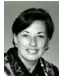
Hon. Elizabeth Witmer, Minister of Health, Ontario

By working together we are transforming tomorrow's possibilities into today's certainties, and building a health system to meet the needs of our population in the 21st century. K