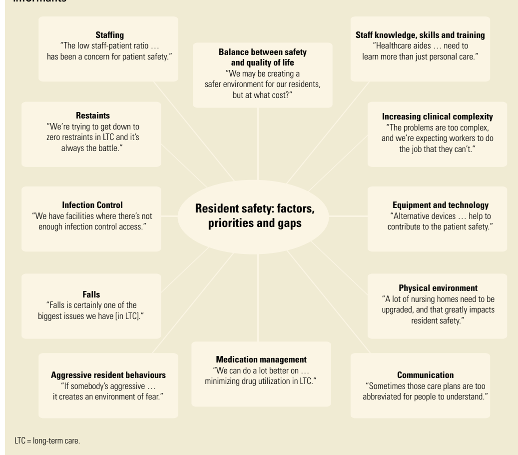
Figure 1. Factors, priorities and gaps in resident safety in long-term care as identified by key informants

Many elements of the design of LTC facilities impact safety. Respondents discussed challenges with older buildings resulting from