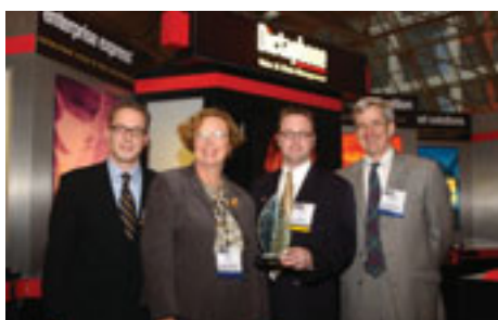
“Best Double Booth” – Dictaphone Canada