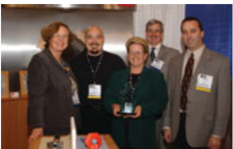
“Best New Exhibitor” – FlashCove Prefabricated Bases Inc.