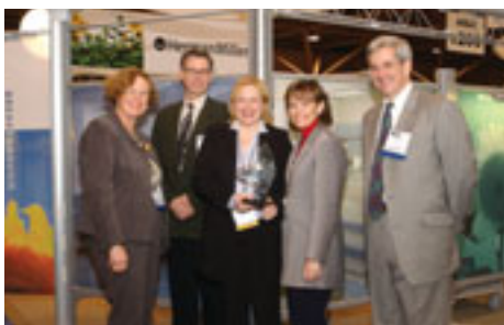
“Best of the Show” – Herman Miller for Healthcare