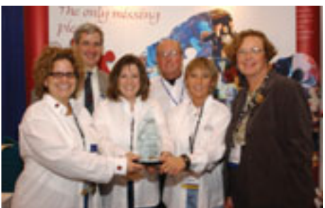
“Best Single Booth” – Cambridge Memorial Hospital