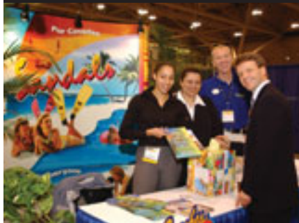
► Sandals and Beaches Resorts – one of the exhibitors in the Life and Health Zone donated a prize for one lucky draw – a seven-night stay for two adults at a Sandals Resort.