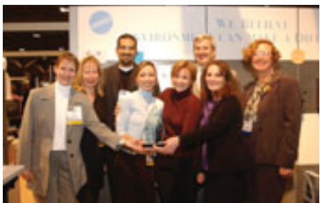
“Best Multiple Booth” – Steelcase Canada Ltd.