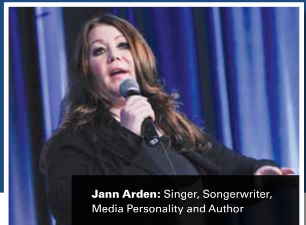
Jann Arden: Singer, Songwriter, Media Personality and Author