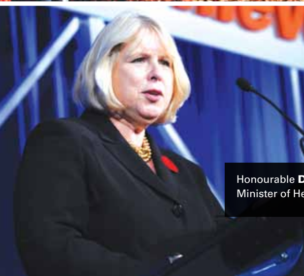
Honourable Deb Matthews , Minister of Health and Long-Term Care