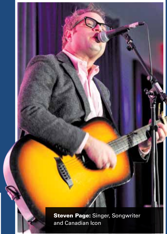
Steven Page: Singer, Songwriter and Canadian Icon